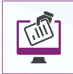
Software and Templates