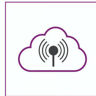
Access Point Application Integration